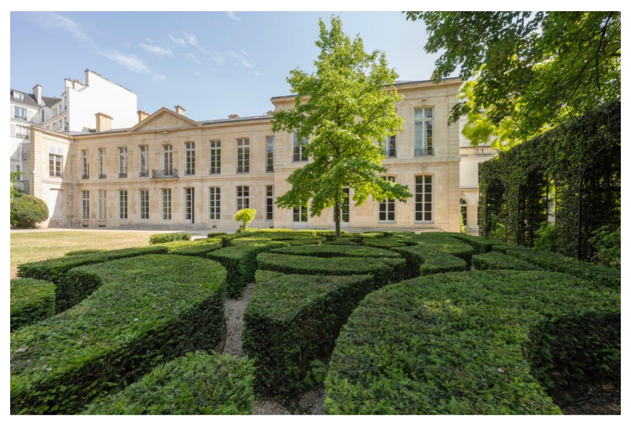
L'hôtel de Maisons, Paris.